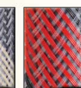
RS Red Spiral