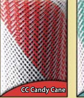
White with Red Spiral