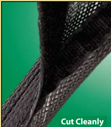
Cut Cleanly Hot Knife